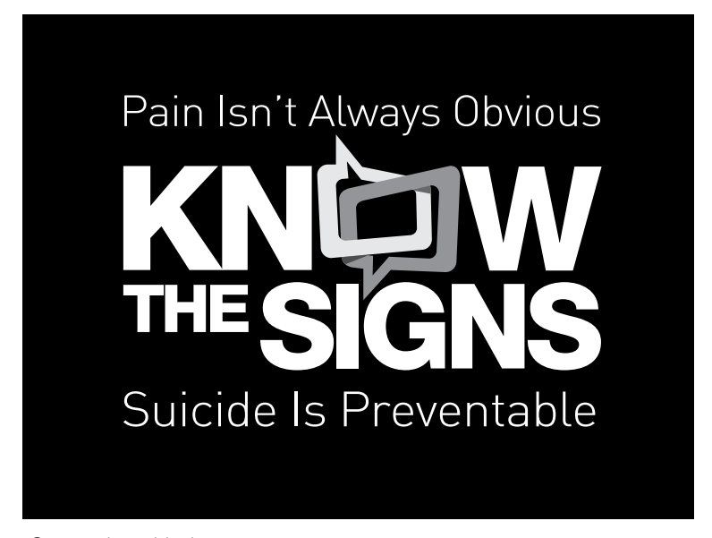
Grey scale on black.