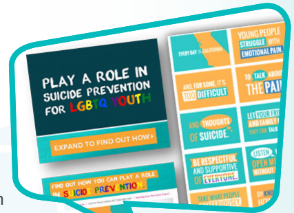
LGBTQ Youth (English)