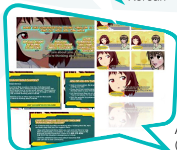
API Youth (English)