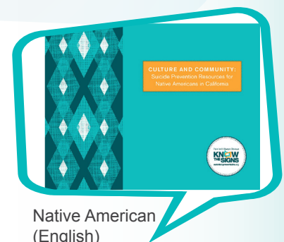
Native American (English)